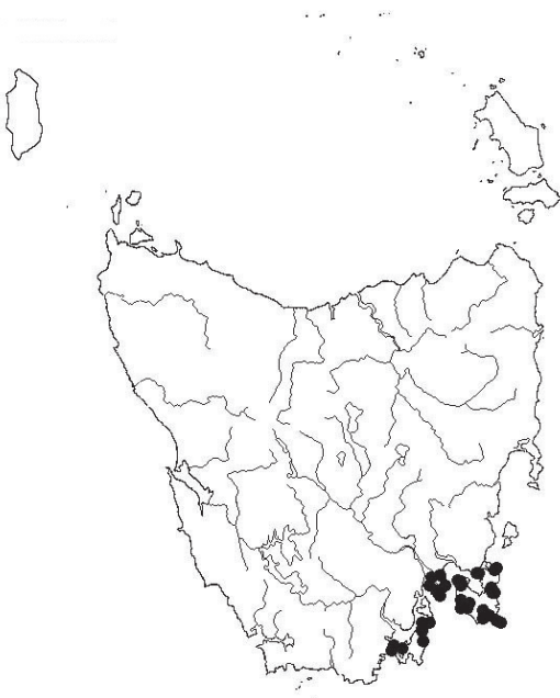
Figure 4. Distribution of Correa alba var. rotundifolia DC, based on herbarium specimens.