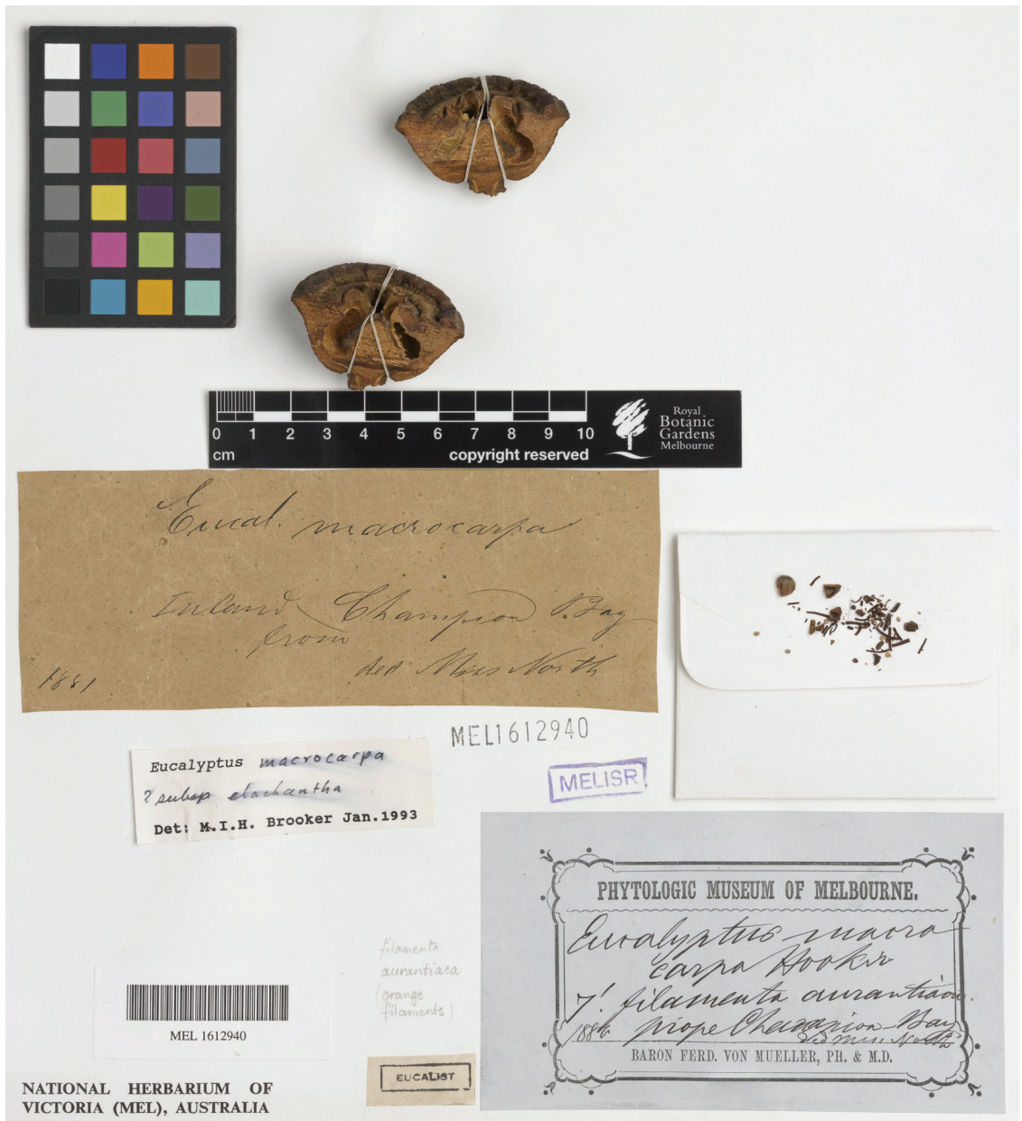
Figure 1. MEL 1612940, Eucalyptus macrocarpa subsp. elachantha Brooker & Hopper, collected by Marianne North in 1881

The final volume of the Flora was published in 1878, after which date it would seem that Mueller had less