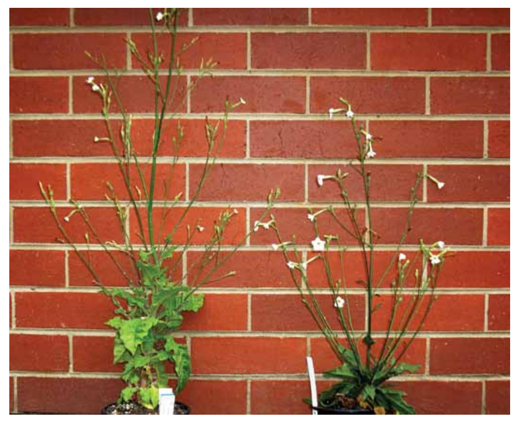
Figure 2. Habits of plants at first flowering. N. maritima at left and N. 'Cape Schanck'at right. Cultivated, RBGV Melbourne nursery.