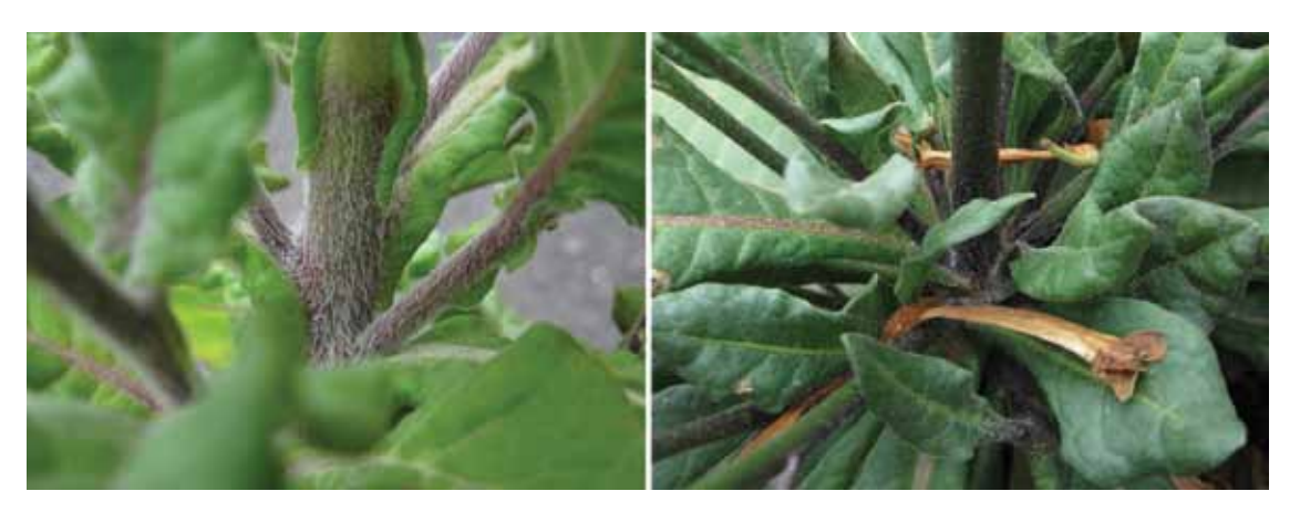
Figure 3. Leaf bases and lower stem indumentum; N. maritima . Note dense indumentum, sub-auriculate leaf bases and winged petioles. Cultivated, RBGV Melbourne nursery.