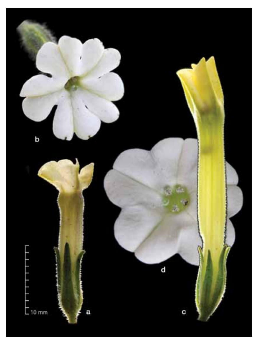
Figure 1. Corolla tube and limb. a., b. Nicotiana maritima, N. Walsh 8477 , MEL; c., d. N. 'Cape Schanck', N.G. Walsh 8476 , MEL.