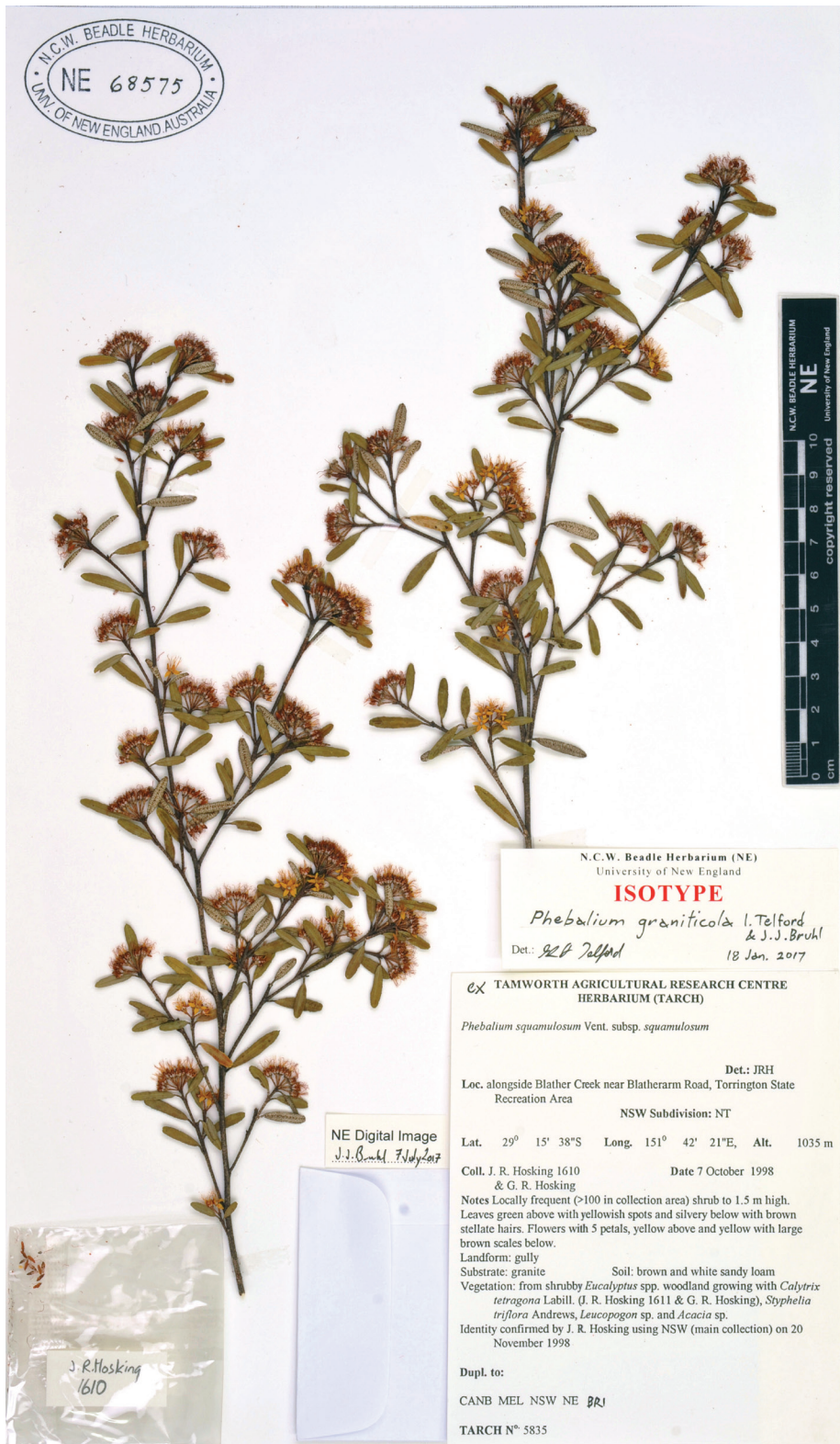
Figure 2. Isotype of Phebalium graniticola I.Telford & J.J.Bruhl (NE).