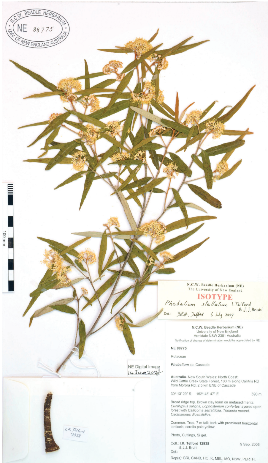
Figure 3. Isotype of Phebalium stellatum I.Telford & J.J.Bruhl (NE).