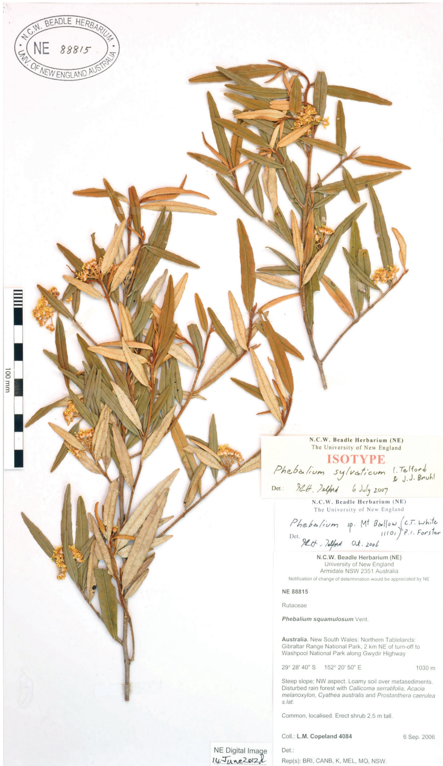
Figure 5. Isotype of Phebalium sylvaticum I.Telford & J.J.Bruhl (NE).