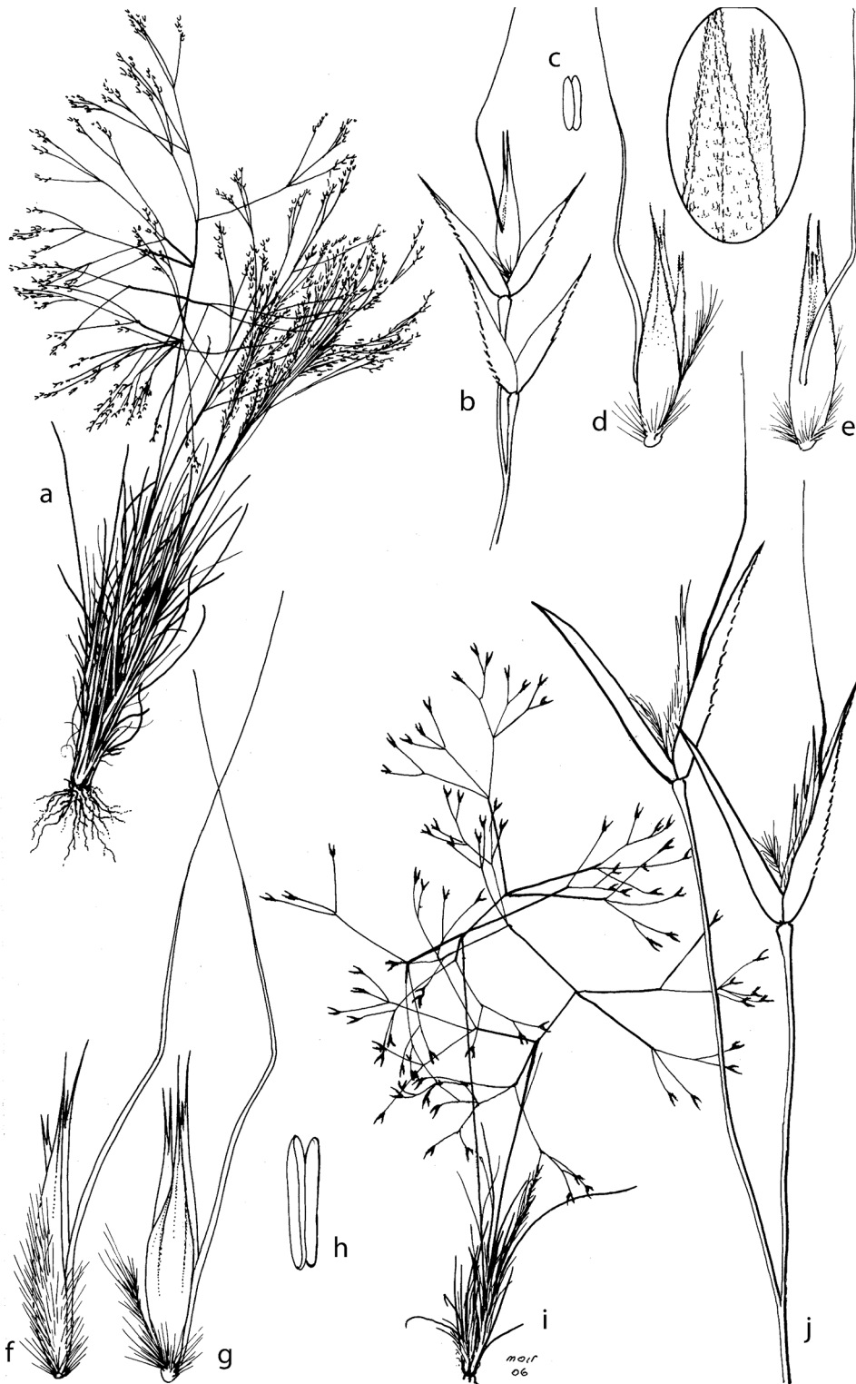
Figure 1: Lachnagrostis robusta : a tussock x0.3, b spikelets x5, c anther x10, d floret, lateral view x10 (detail x20), e floret, dorsal view x10 (A.J.Brown 1149 MEL2133221). L. punicea subsp. punicea : f floret, lateral view x10 (A.J.Brown 1047 MEL2131439). L. punicea subsp. filifolia : g floret, lateral view x10, h anther x10, i tussock x0.3, j spikelets x5 (A.J.Brown 1473 MEL2125359).