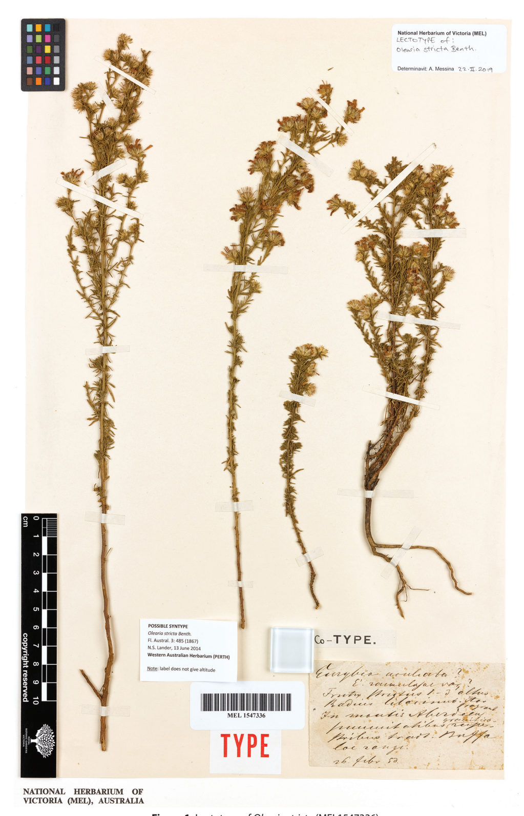
Figure 1. Lectotype of Olearia stricta (MEL1547336).