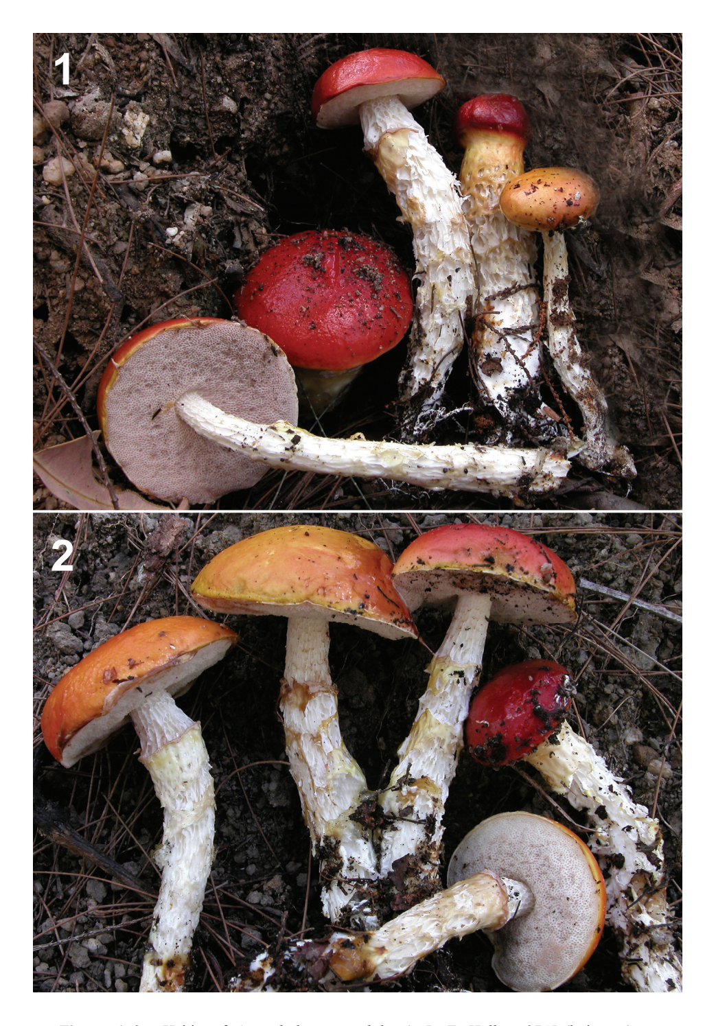
Figures 1–2. Habits of Austroboletus mutabilis . 1. R. E. Halling 8745 (holotype), \times 0.75. 2. R. E. Halling 8768 , \times 0.75.