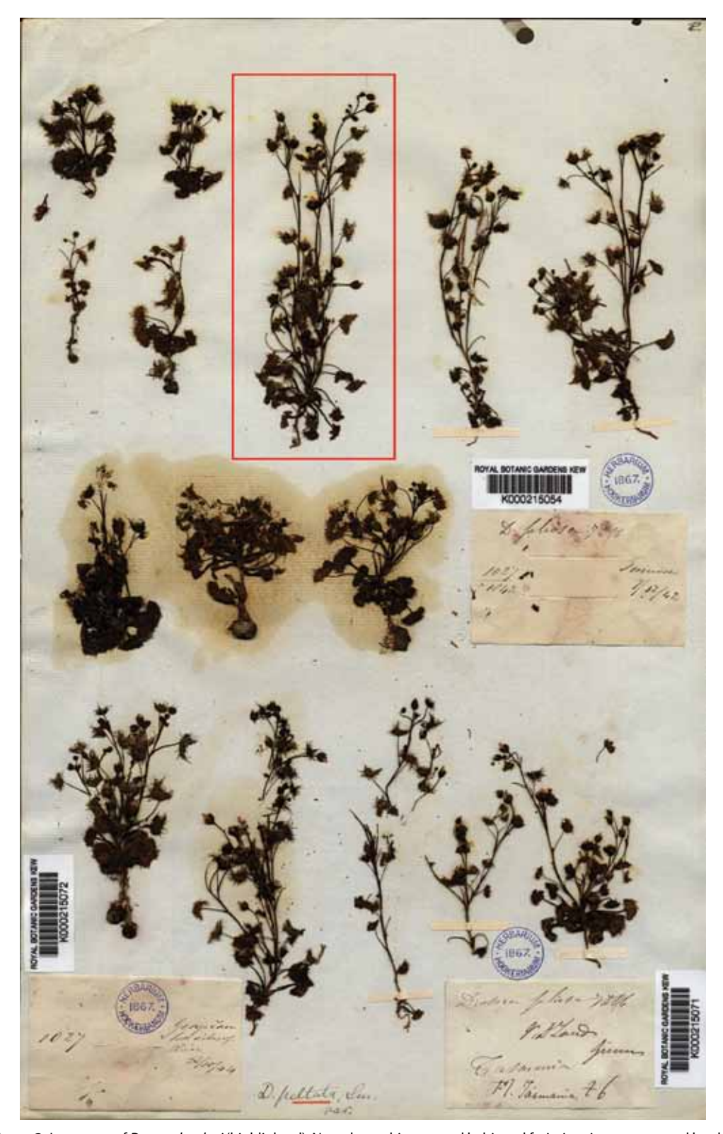
Figure 3. Lectotype of Drosera hookeri (highlighted). Note the multi-stemmed habit and fruit ripening near ground level.