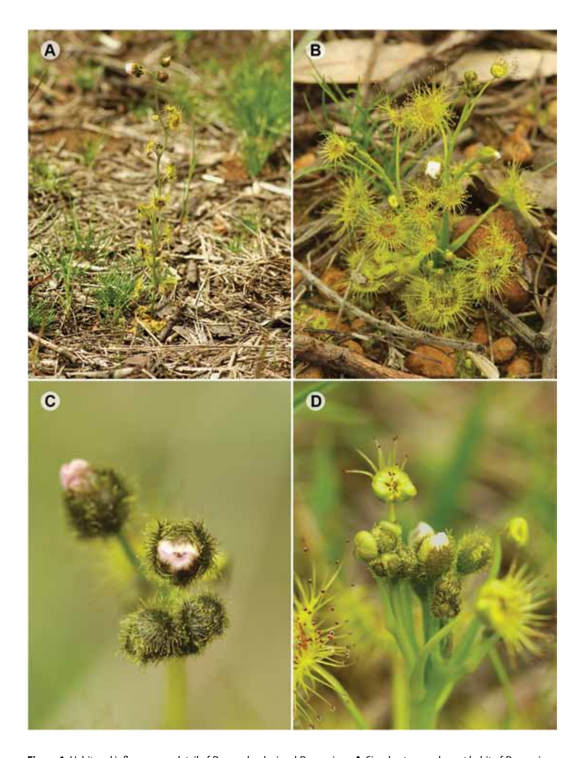
Figure 1. Habit and inflorescence detail of Drosera hookeri and D. gunniana . A. Simple-stemmed, erect habit of D. gunniana . Note multiple vegetative nodes below the inflorescence. B. Short, multi-stemmed habit of D. hookeri . Note inflorescence arising from first vegetative node. C. Inflorescence detail of D. gunniana . Note the long indumentum and almost spherical buds. D. Inflorescence detail of D. hookeri . Note the short indumentum and elongated buds.