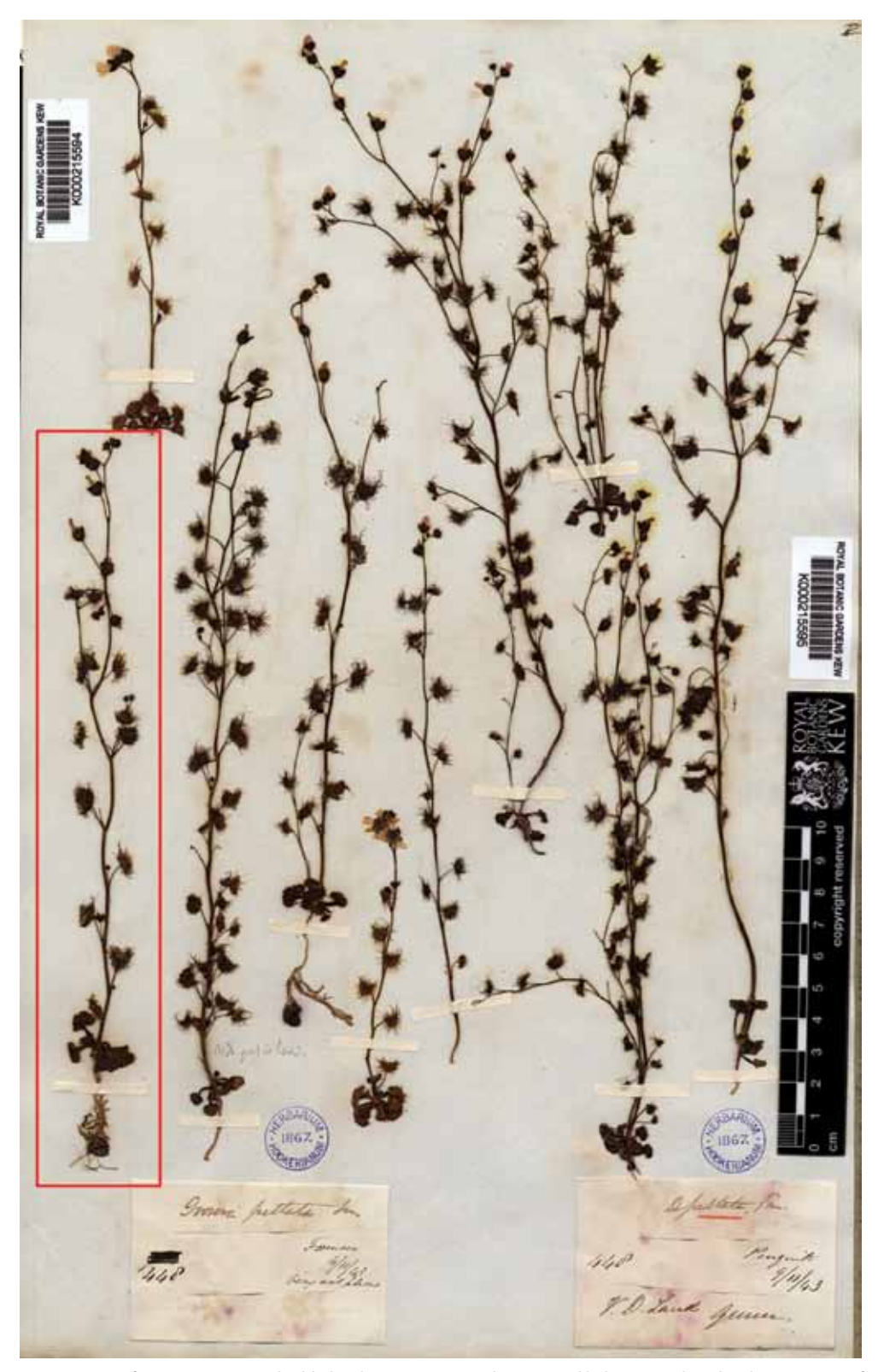
Fig. 4. Lectotype of Drosera gunniana (highlighted). Note erect, single-stemmed habit.