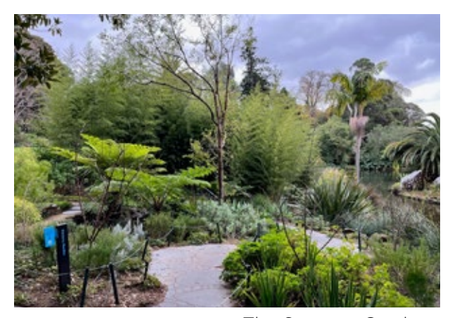
The Sensory Garden