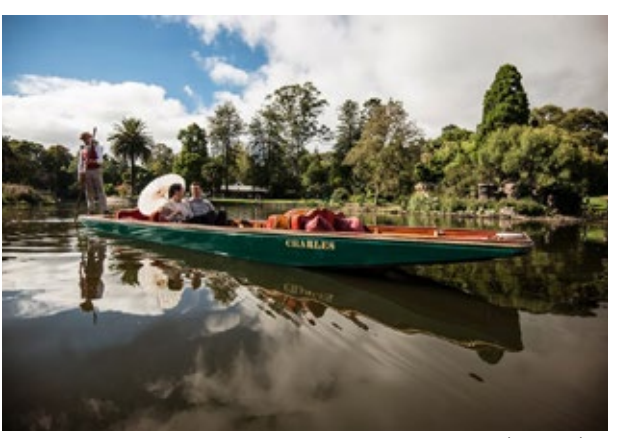
Punting on the Lake