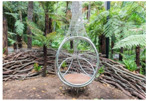
The Bird's Nest