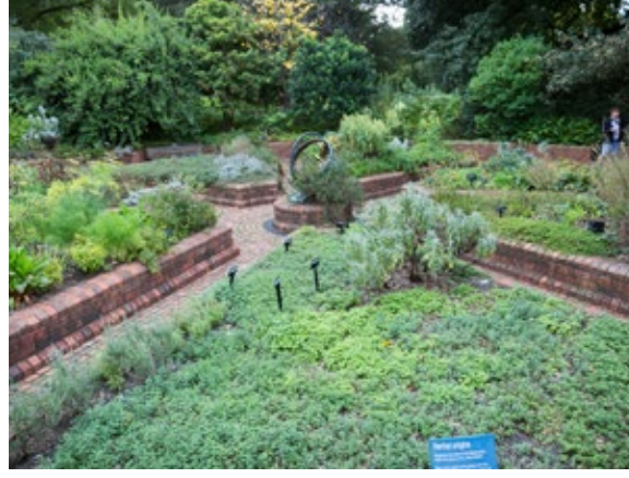
The Herb Garden