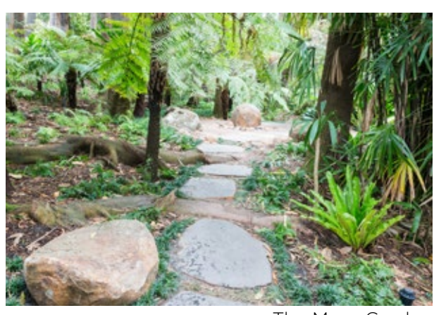
The Moss Garden