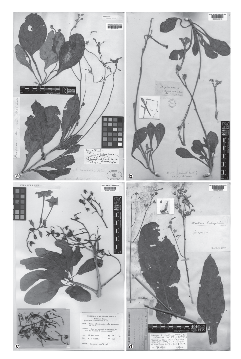
Figure 2. Specimens of Nicotiana. a. N. forsteri, type, J.R. & G. Forster, 29–30.ix.1774, Botany Isle, New Caledonia (BM) © The Natural History Museum, London. b. N. fragrans, type, Milne, x.1853, Isle of Pines, New Caledonia (K). c. N. fatuhivensis, P.A. Schafer 5705, 19.viii.1975, Mohotani Island, Marquesas Islands (K). d. N. debneyi, type, J. Dallachy, 1868, Rockingham Bay, Queensland, Australia (K). b, c, &d. © The Board of Trustees of the Royal Botanic Gardens, Kew. Reproduced with the consent of the Royal Botanic Gardens, Kew.