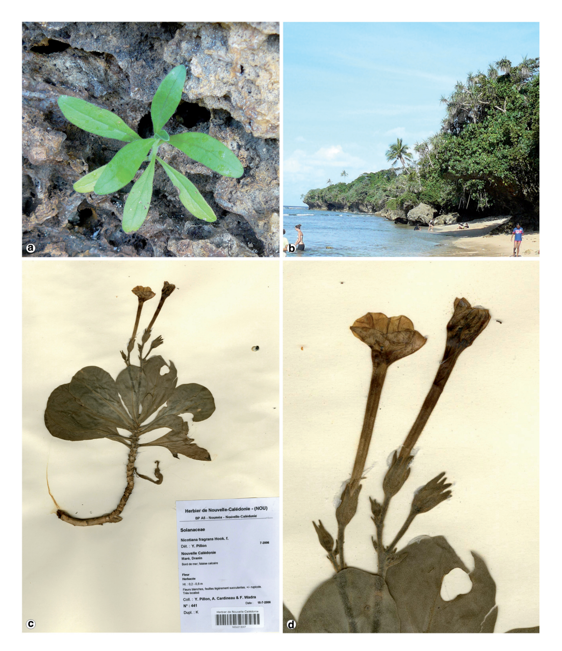
Figure 3. Nicotiana fragrans Hook. a. N. fragrans growing wild in fissures in a beachside rock, Grande Terre, New Caledonia (photo P.Y. Ladiges). b. Beachside habitat of (a) (photo P.Y. Ladiges). c. N. fragrans, Y. Pillon 441, 15.vii.2006, Dranin, Maré, Nouvelle-Calédonie, calcareous cliff (NOU) —the woody caudex is clearly shown. d. close view of flowers